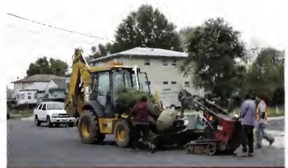
Figure 10. Only non-ALB host trees can be planted in regulated areas.

When ALB adults emerge from the trunks and limbs of host trees, the insects leave behind exit holes. These